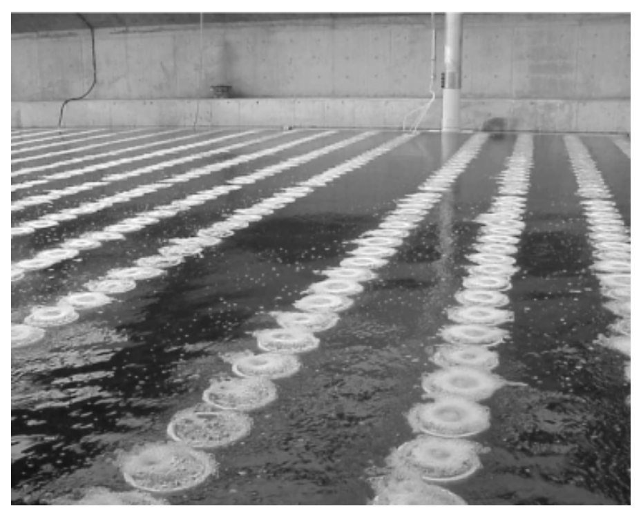
Fine Bubble Diffusers installed in 2001

JEA's innovative biosolids project colocated at the site Buckman produced the first pellets on Oct. 3. 2002. It involves turning the residual biosolids from the waste water treatment process into а marketable, granular fertilizer product called