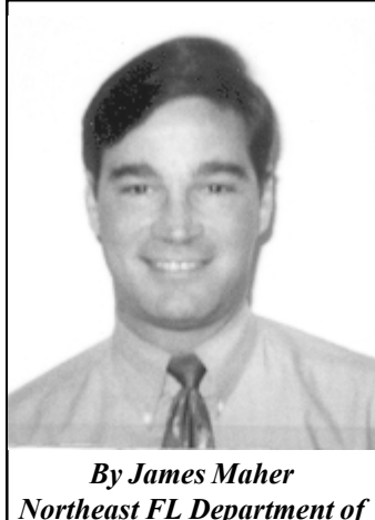
Northeast FL Department of Environmental Protection

A nutrient TMDL for the Lower St. Johns River Basin has been set and incorporated into rule. TMDL stands for is Total Maximum Daily Load and it identifies the